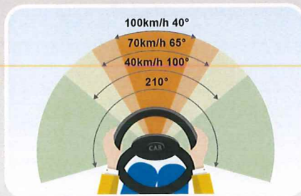
Chart 2 The slower a car's speed, the wider the driver's field of vision. 圖2 行車速度愈低，駕駛人視野愈廣